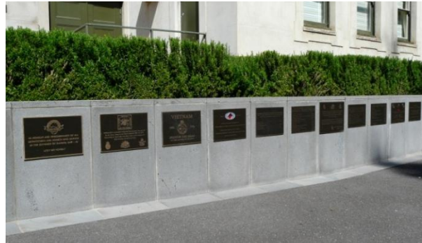
Bendigo Memorial Wall