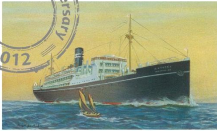
Rabaul & Montevideo Maru